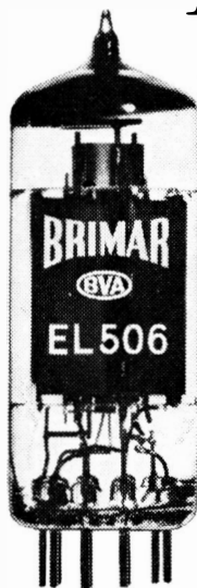
B 9D (Magnoval) Base

New High Sensitivity Audio Pentode offering high output and low distortion